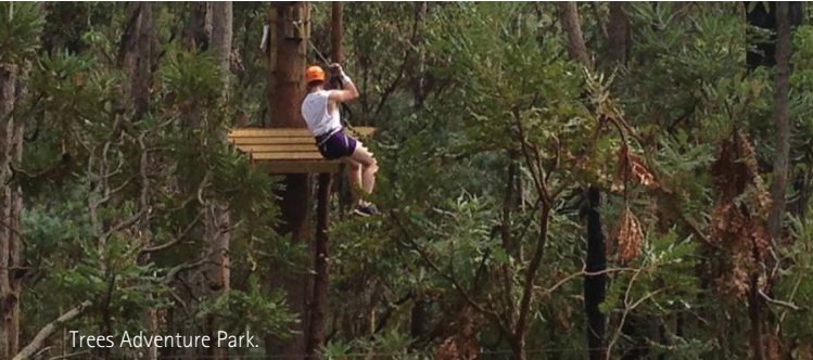
Trees Adventure Park.

Located near the Nanga campgrounds, the park has tree-top rope courses, suspension bridges and flying foxes. Booking is required and entry fees apply. For details go to treesadventure.com.au