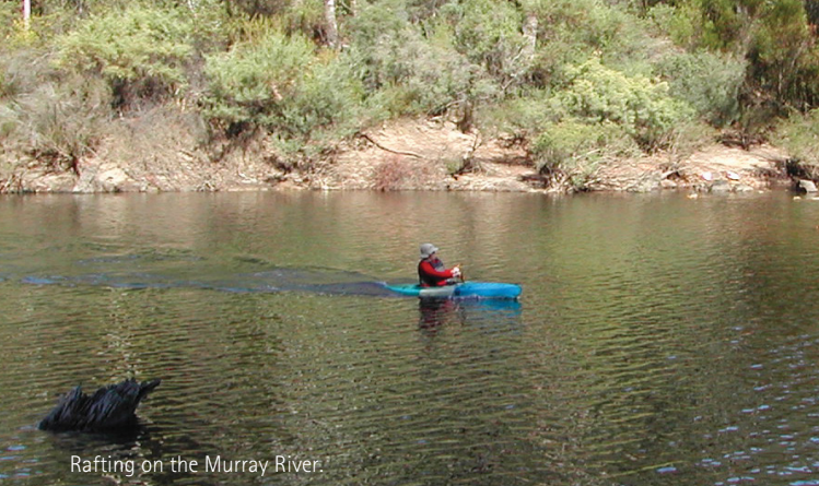
Rafting on the Murray River.