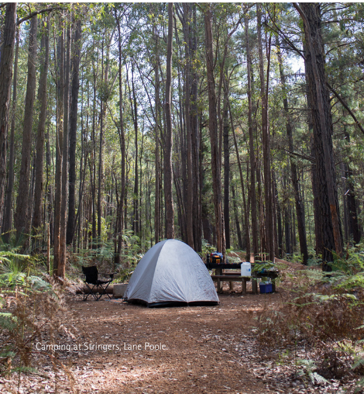
Camping at Stringers, Lane Poole.